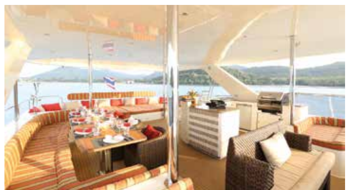
View of Flybridge