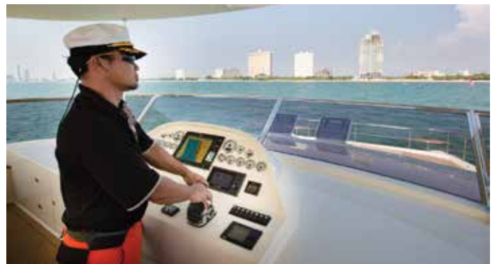
Helm with 360o Pannoramic View