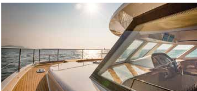
Tempered Glass windows, comfortable and safe side decks