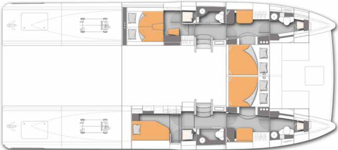
Galley, Saloon, Helm and Cabines area