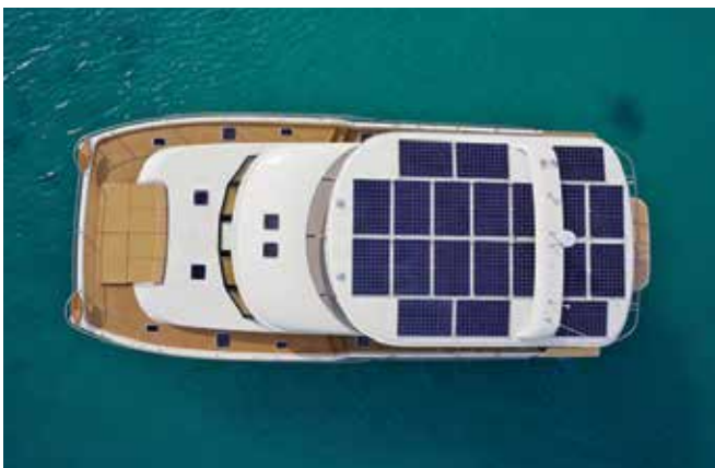
Heliotrope 65, the world's first solar assisted luxury catamaran yacht

With her contemporary looks, Heliotrope 65 is the quintessence of Albatross Marine Design's philosophy of pairing functionality and safety with elegance. This luxury yacht is designed for long distance cruising while living comfortably on board. With both fly bridge and salon being very spacious she also offers ample opportunity to entertain. With a solar output of up to 7 kW Heliotrope 65 is one of the very few mixed energy luxury yachts presently on the market.