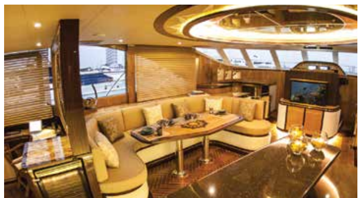
View of Saloon and Helm from Galley