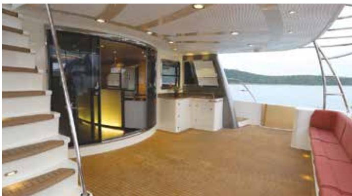
View of Cockpit