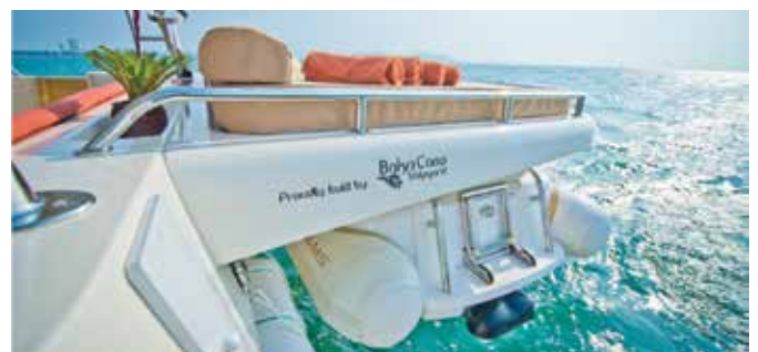
Stern platform with tender protected from weathering